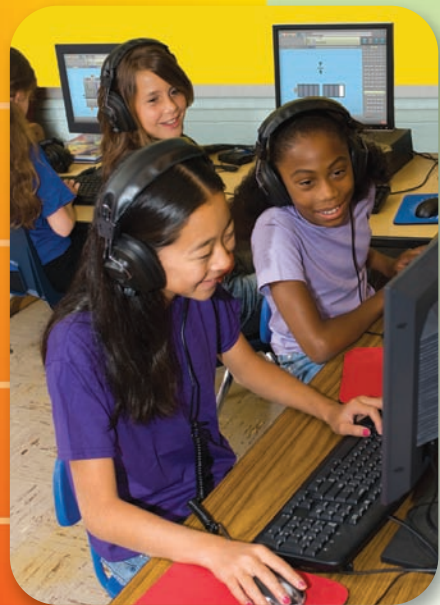
Data from Department of Education Georgia Report Card

Students with disabilities (SWD) at Banks Stephens Middle School have closed the achievement gap with math gains of 41 percentage points - from 37% to 78% for students who meet or exceed the standard.